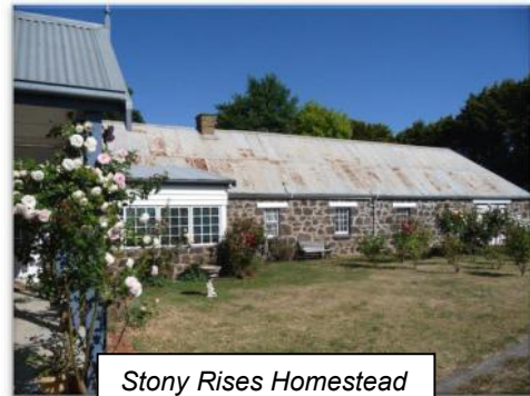
Stony Rises Homestead

Situated half way between Camperdown and Colac, the historic property once took in an area of 13,000 acres. The wonderful homestead dates from c.1863.